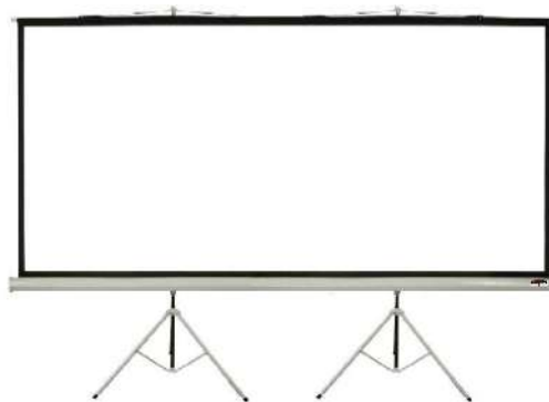
TMP-150D with Dual Leg

We reserve the right to make changes without prior notice. Therefore, all designs, specifications, and product features are subject to change without notice.